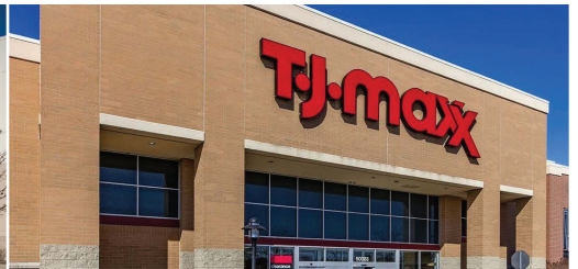
WATERSIDE Detroit, MI