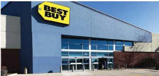
DOWNERS PARK Chicago, IL