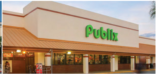
ROCKLEDGE SQUARE Rockledge, FL