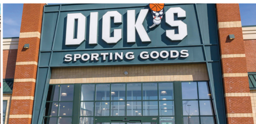
NORTH HEIGHTS PLAZA Dayton, OH