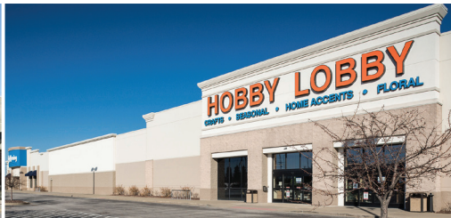
MEGAN CROSSING St Louis, MO