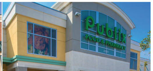
WINDOVER SQUARE Melbourne, FL