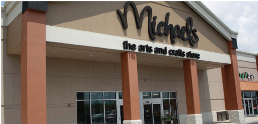
CENTRE AT WESTBANK New Orleans, LA