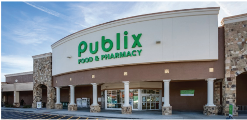
ABBOTTS VILLAGE Atlanta, GA