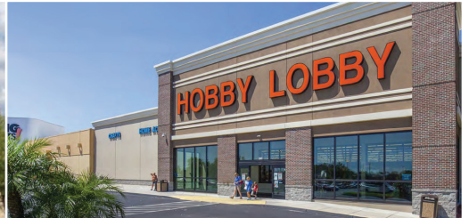
VILLAGE PLAZA Lakeland, FL