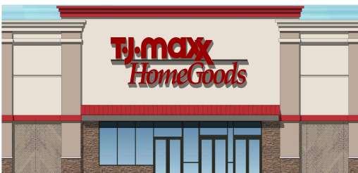
DOWNERS PARK Chicago, IL