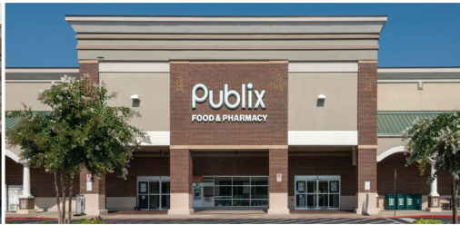
EAST CHEROKEE Atlanta, GA