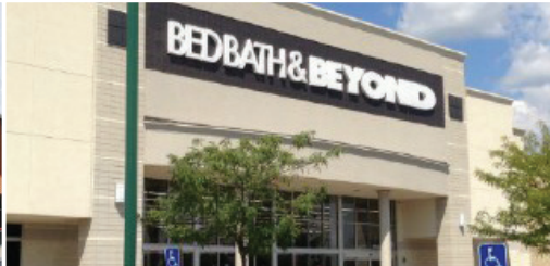
HARTMAN HERITAGE Kansas City, MO